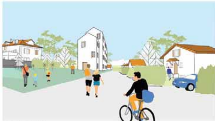
5 YEARS FROM NOW!