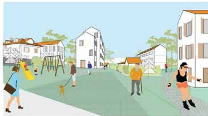
10 YEARS FROM NOW!