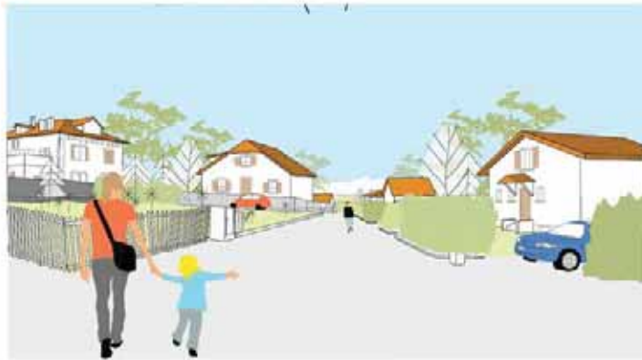
CUL DE SAC DEVELOPMENT OVER TIME: NOW!